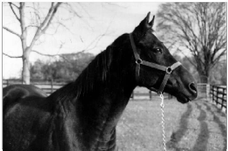
The Florida-bred Dark Devil had 116 starts in nine years. He won six of them. "He was like a pet," said his trainer.

Like Exceller, some of our retirees were great on the racetrack in the conventional