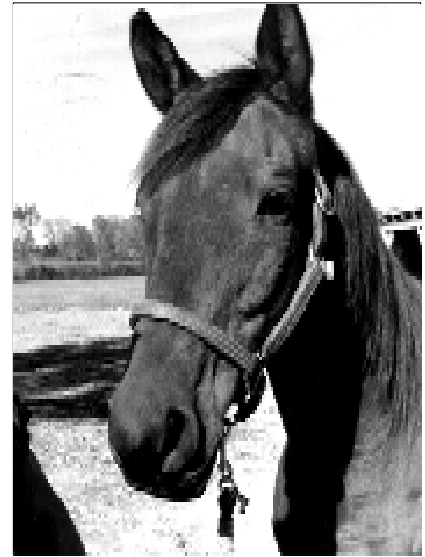
Delta Leader—where would he be today without the TRF? Without your life-giving support?