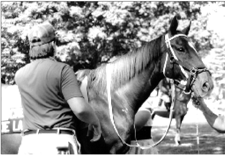
A favorite with New York racetrackers in his eight years on the track, Creme de la Fete paid a return visit to Saratoga Springs, the scene of former victories, in 1992.

meaning of the term—stakes winners, champions, high earners. And as was the case with Exceller, their outstanding performances were no guarantee of a natural end to a long and meaningful life. Who can forget the agonizing story of Banker's Jet, a winner of 28 races and $679,381 in his eight-season career? Said his last trainer, "He'd have run on broken bottles." Jet was discovered by the TRF near death from starvation, alone in a paddock with not so much as a wisp of hay or a drop of water. Nursed back to health by student inmates at our flagship farm in Wallkill, New York, Jet now spends idyllic days gambling in a paddock with his constant companion, the mare Fashion Note, at a TRF satellite farm in Connecticut.